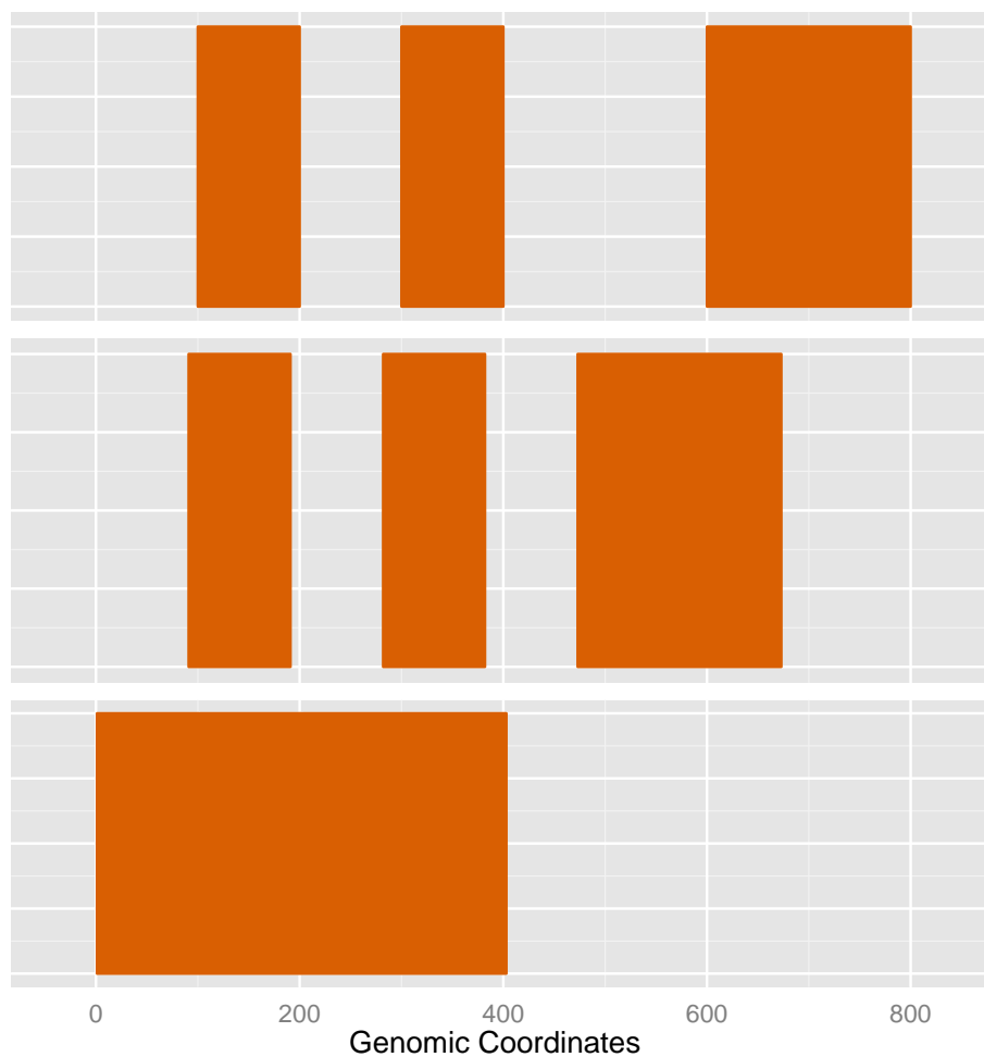
Figure 5: Shrink single GRanges. The first track is original GRanges, the second one use a ratio which shrink the GRanges a little bit, and default is to remove all gaps shown as the third track