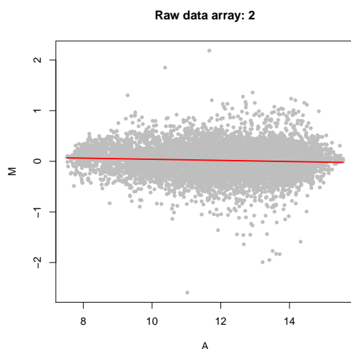
Figure 2: Normalization of array data using pspline: Normalization of the swirl microarray data using the pspline-function, the fit to array two is shown