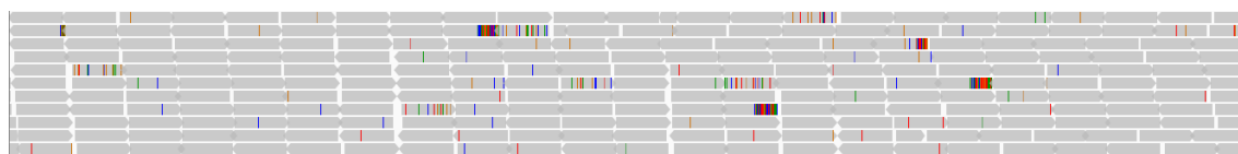
Figure 3: Simulated reads mapped in proper pair. Mismatches and soft-clips are shown as colored vertical lines in reads.