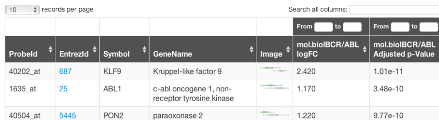
Figure 5: Resulting page created for analysis of a microarray study with limma .