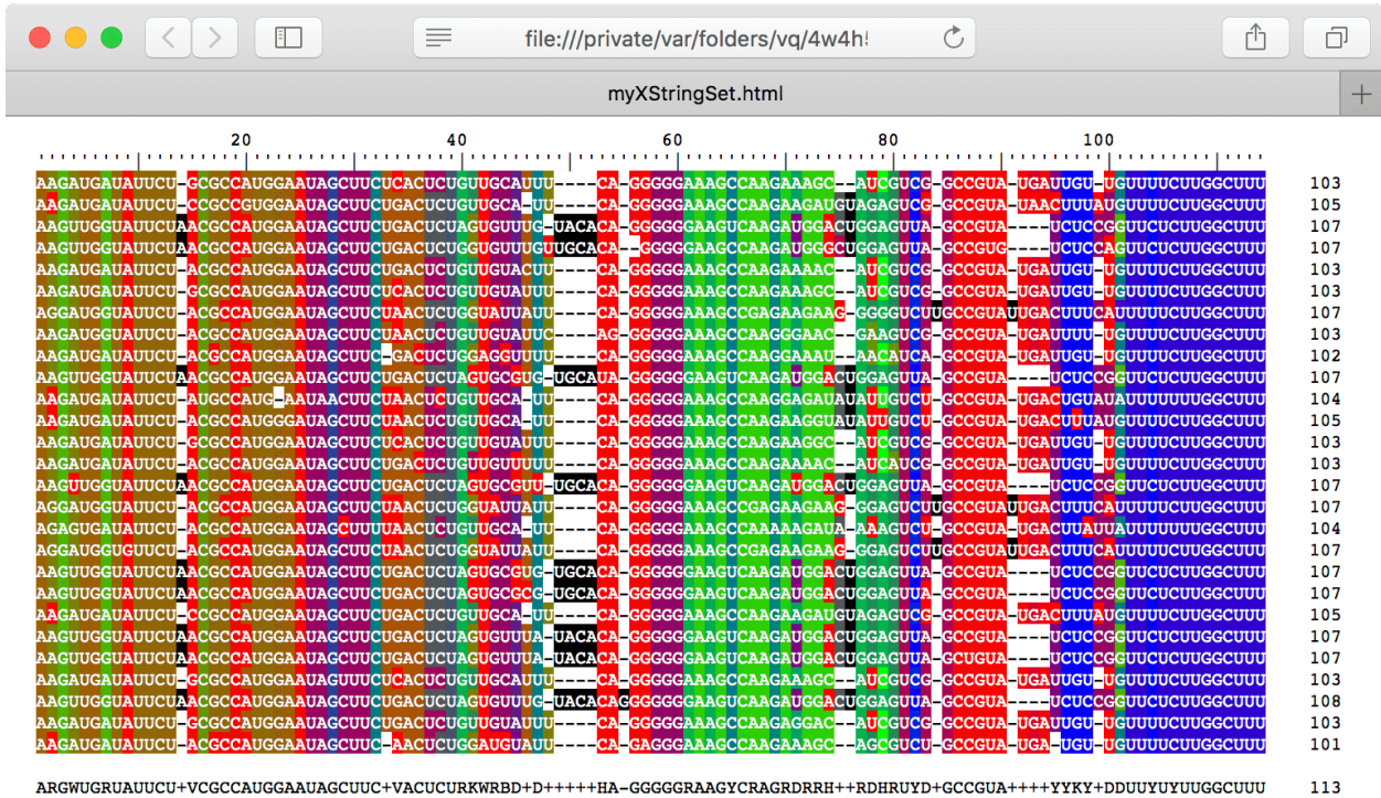
Figure 1: Predicted secondary structure of IhtA