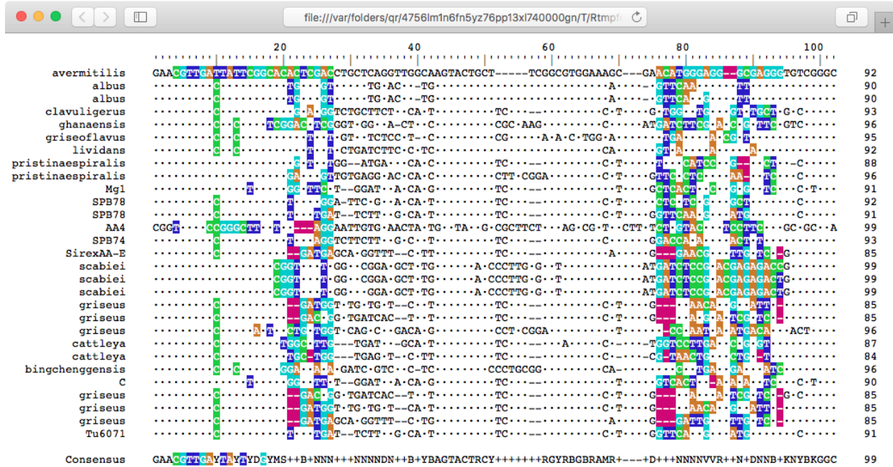
Figure 2: Amplicon with the target site for each primer colored

> BrowseSeqs(amplicon, colorPatterns=c(4, 27, 76, 94), highlight=1)