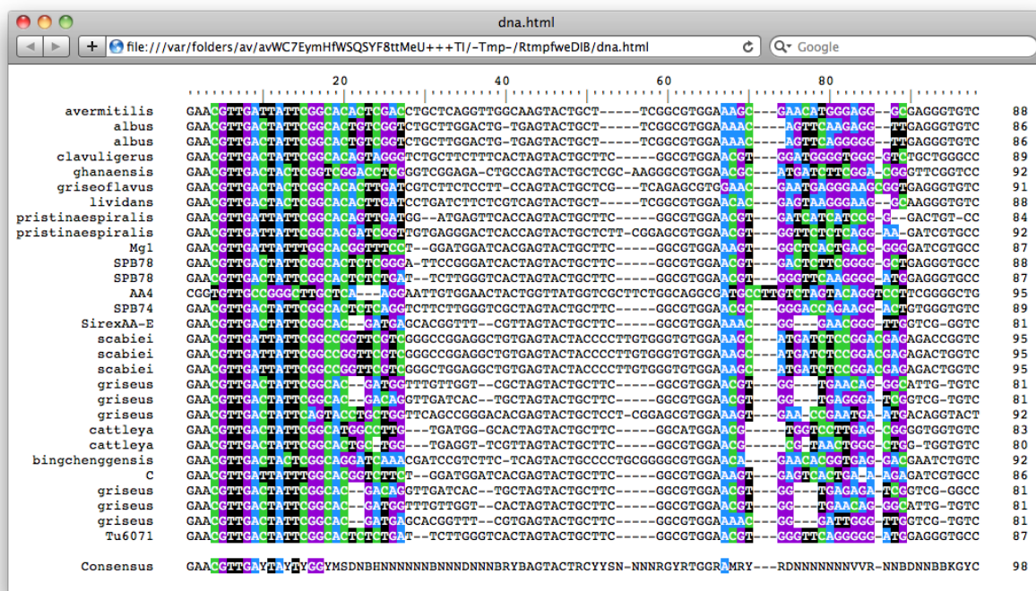
Figure 2: Amplicon with the target site for each primer colored